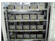
• Multi stack offloading magazine zone