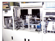
• UV cure unit